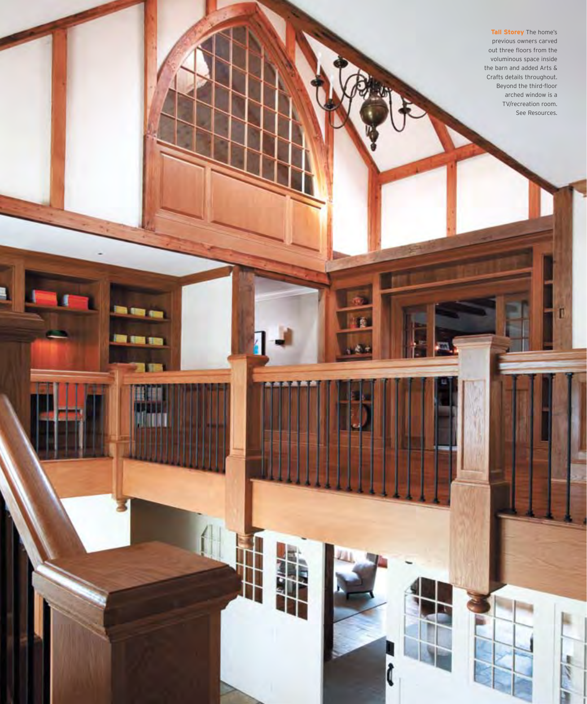
Tall Storey The home's previous owners carved out three floors from the voluminous space inside the barn and added Arts & Crafts details throughout. Beyond the third-floor arched window is a TV/recreation room. See Resources.