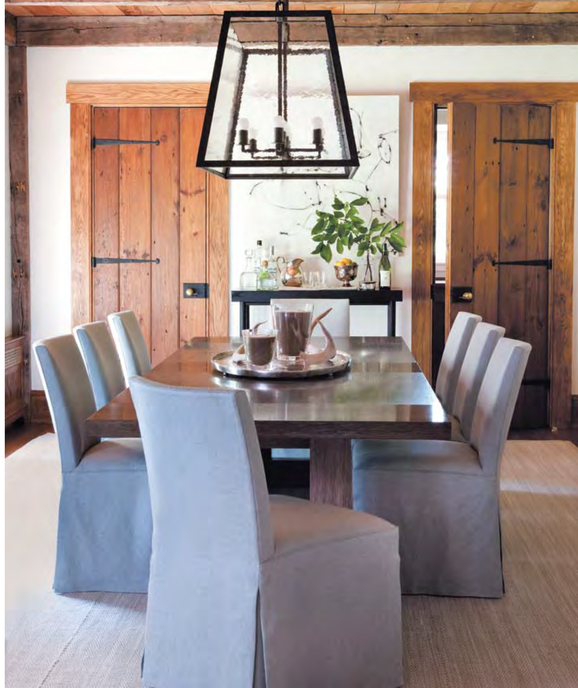
Lounging Around In one of two mirror-image sitting areas (ABOVE) in the living room, the designer created a distinctly grown-up, “cocktail lounge” feel. The sectional sofa is from Edward Ferrell Ltd., the fabric from Yoma Textiles and the coffee table from Christian Liaigre. Side Dish The dining room (RIGHT) features a simple, sophisticated mix of materials. The table is from Christian Liaigre, the chairs and chandelier from Holly Hunt. Chair fabric is from Donghia. See Resources.

“The entrance is dramatic, so it had to introduce the narrative of the house,” says Orrick. “You immediately see the big white sliding doors and