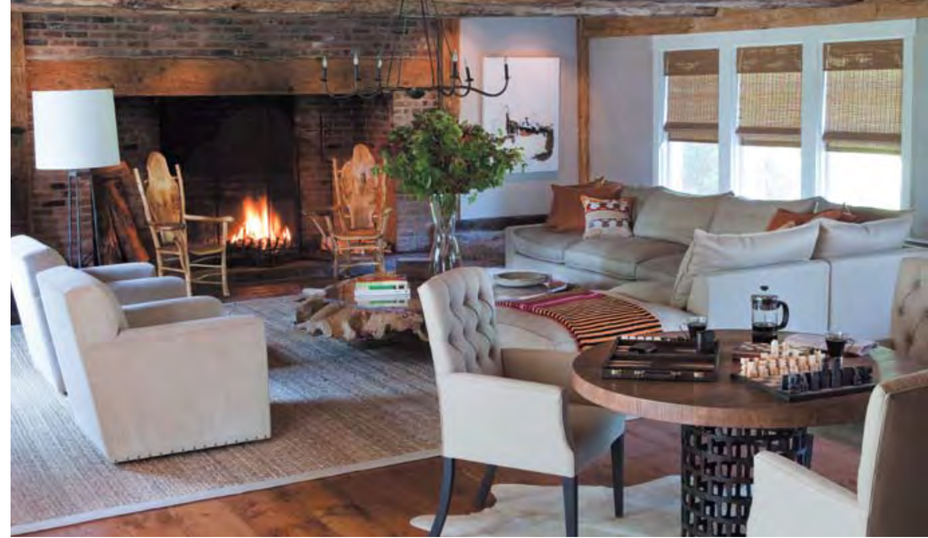
Gathering Room Designed to accommodate a variety of activities, the family room (ABOVE) is styled for comfort. The sofa and chandelier are from Mis en Scene in Greenwich, the rug from Elizabeth Eakins. The game table is from Holly Hunt. Compound Interest The backyard stone patio (BELOW) provides a variety of seating options in the middle of the family compound. This view is from the lawn that separates the main house and several outbuildings, including a guesthouse and squash court. A pool sits beyond the trees at left. See Resources.