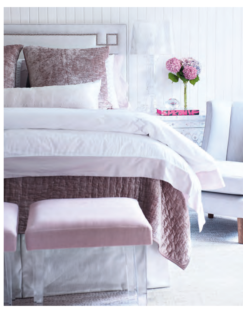
Chic Statement Stools with lucite legs and covered in Pierre Frey's Shabby Buvard are through Tiger Lily's. Bed linens are through Lynnens. Acrylic lamp is through Haute Look. View Finder In the master bedroom, Valentin sconces by Liaigre flank a custom headboard covered in Holly Hunt fabric. Bobbin bench is through Privet House. A cube chest is upholstered in Rogers & Goffigon leather. See Resources .

In contrast, the intimate living room is a more formal space where there's just enough seating for six. "It's a wonderful scale for entertaining small groups, or for when he's there by himself," says Orrick, who continued the color palette with a navy linen sofa and cream-colored chairs.